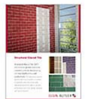
Structural Glazed Tile

All of the Elgin Butler Company's base units: